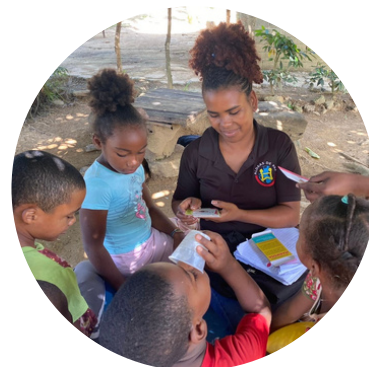
Breaking Barriers & Youth Care Center